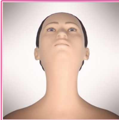
Front - Up the nose (required for nose procedures)