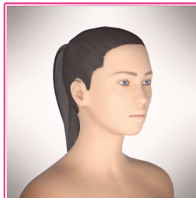
Right Side - 45 Degree Angle (required for nose procedures)

All About Me Makeovers offers a comprehensive range of plastic surgery and cosmetic procedures all aimed at reshaping appearance and improving lifestyles, performed by internationally recognised plastic surgeons.