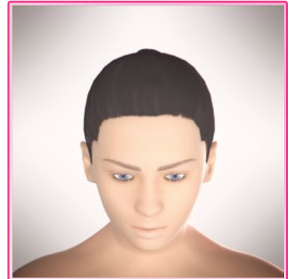
Front - Down the nose (required for nose procedures)